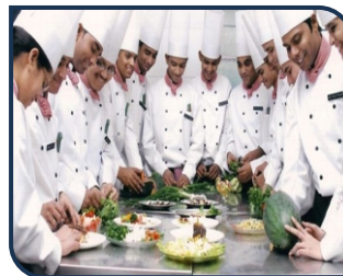
COOK AND HOSPITALITY STAFF